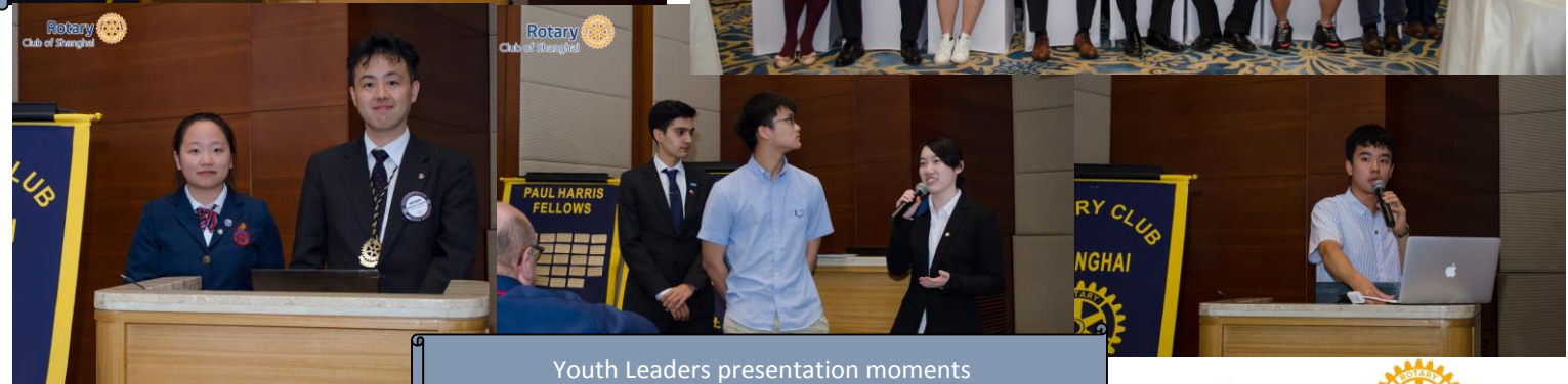
Youth Leaders presentation moments